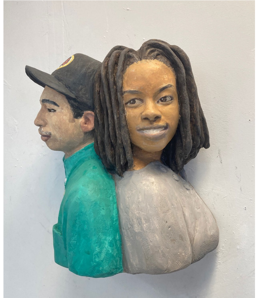
John Ahearn and Rigoberto Torres The LatiNegros Acrylic on plaster 22 x 20 x 11 inches 1992/2018