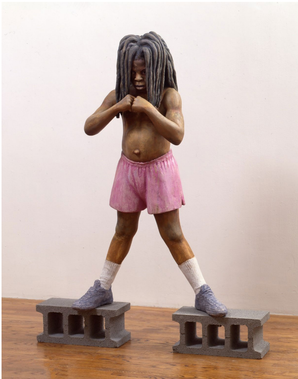
John Ahearn Samson Oil on fiberglass 61.5 x 50.75 x 15 inches 1990