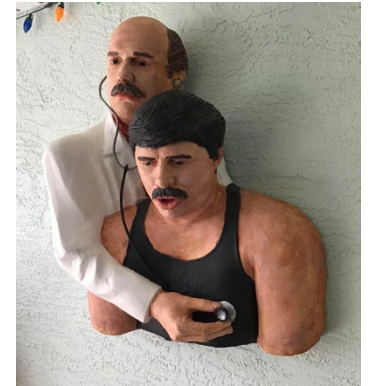
Rigoberto Torres Rigoberto w/His Doctor Acrylic on plaster 30 x 26 x 12 inches 1998