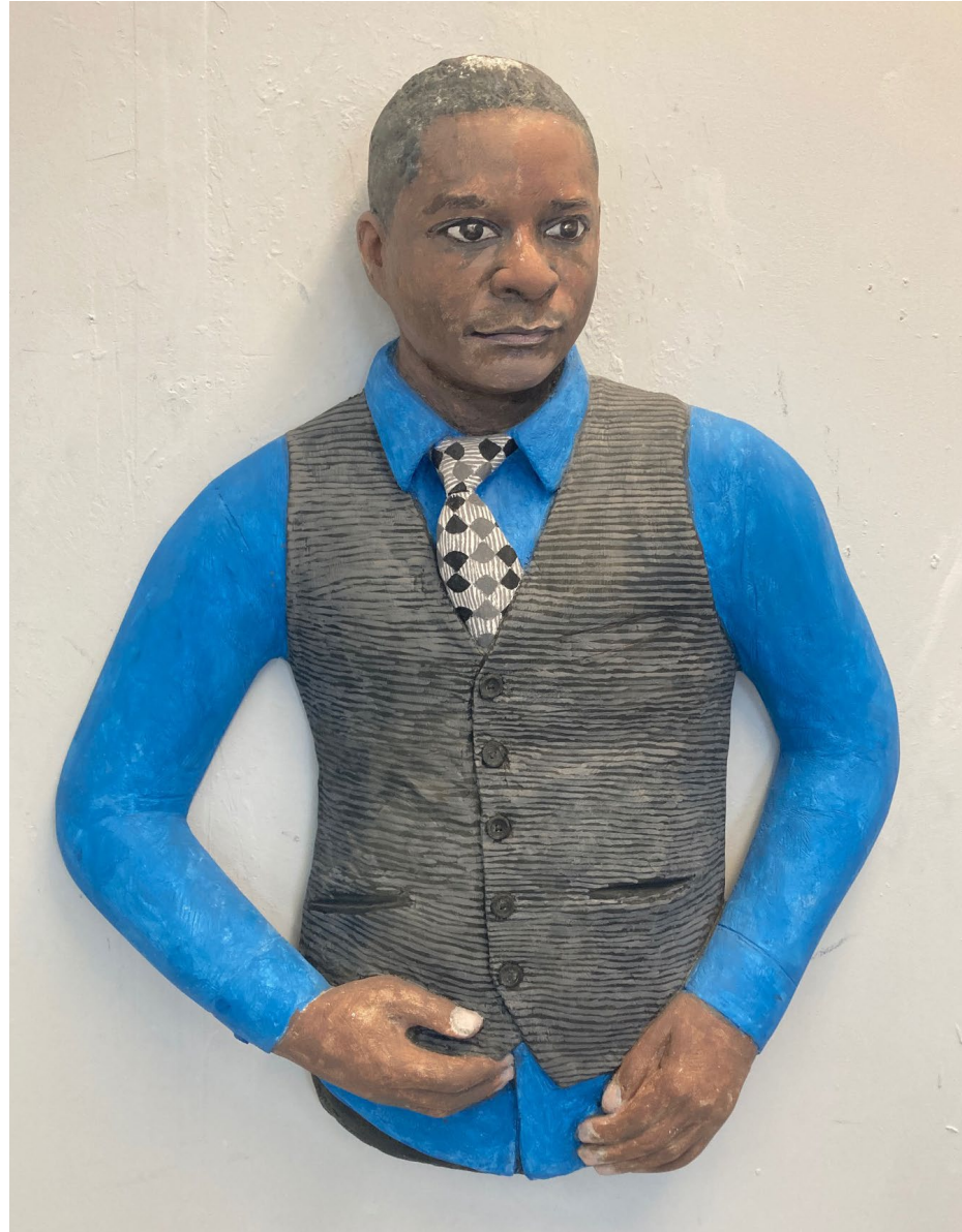
John Ahearn NICO Stepping Out Acrylic on plaster 34 x 28 x 9 inches 2022