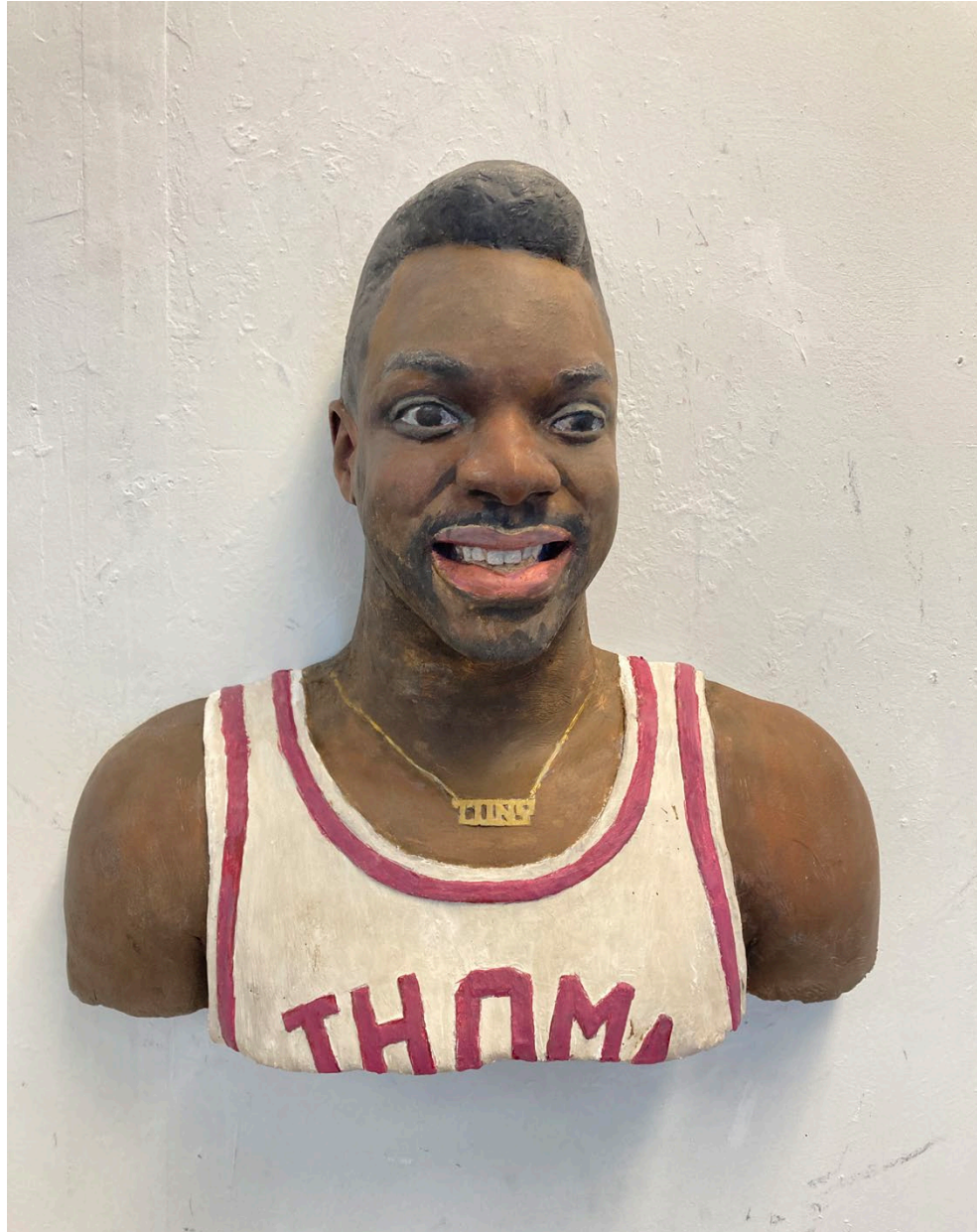
John Ahearn Big Tone Acrylic on plaster 21 x 21 x 8 1/2 inches 1988