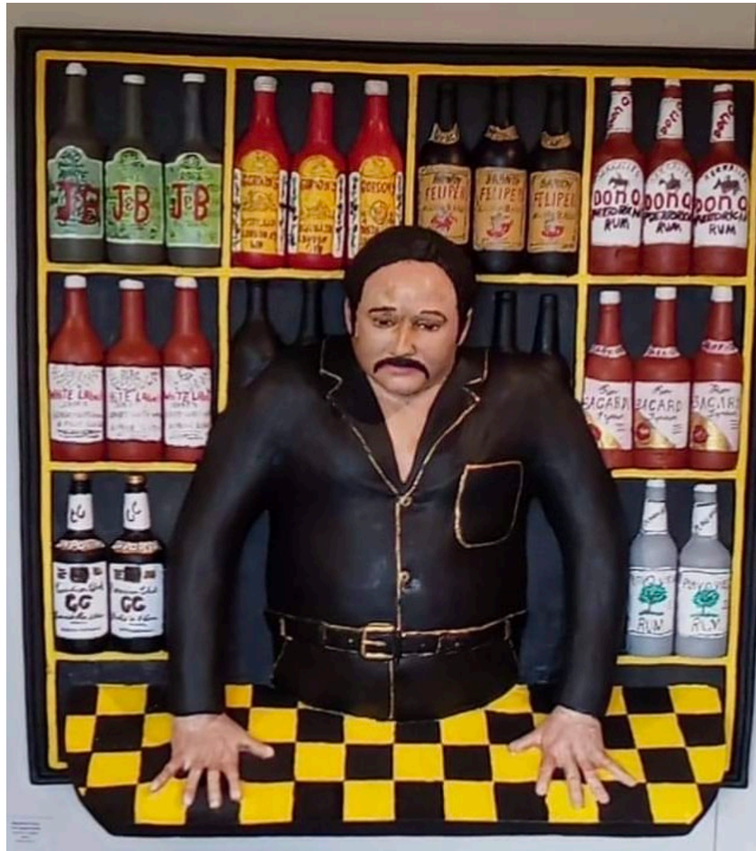
Rigoberto Torres Uncle Tito at His Liquor Store Acrylic on plaster 48 x 48 x 14 inches 1983/1998/2020