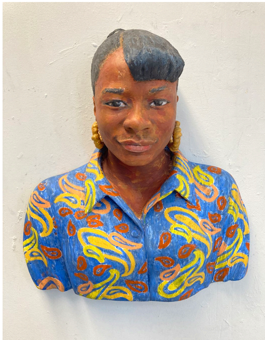
John Ahearn Nikki Acrylic on plaster 22 x 19 x 7.5 inches 1991