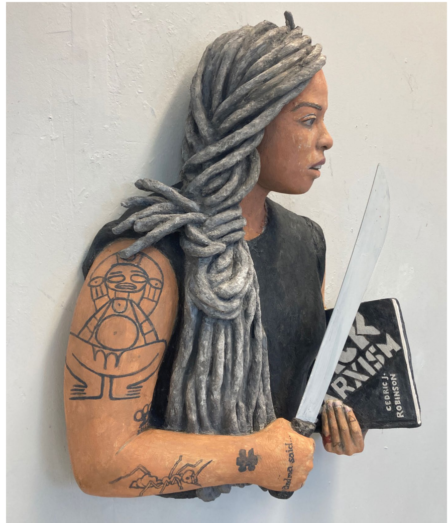
John Ahearn and Rigoberto Torres Shellyne's Radical Education Acrylic on plaster 34 x 24 x 9 inches 2022