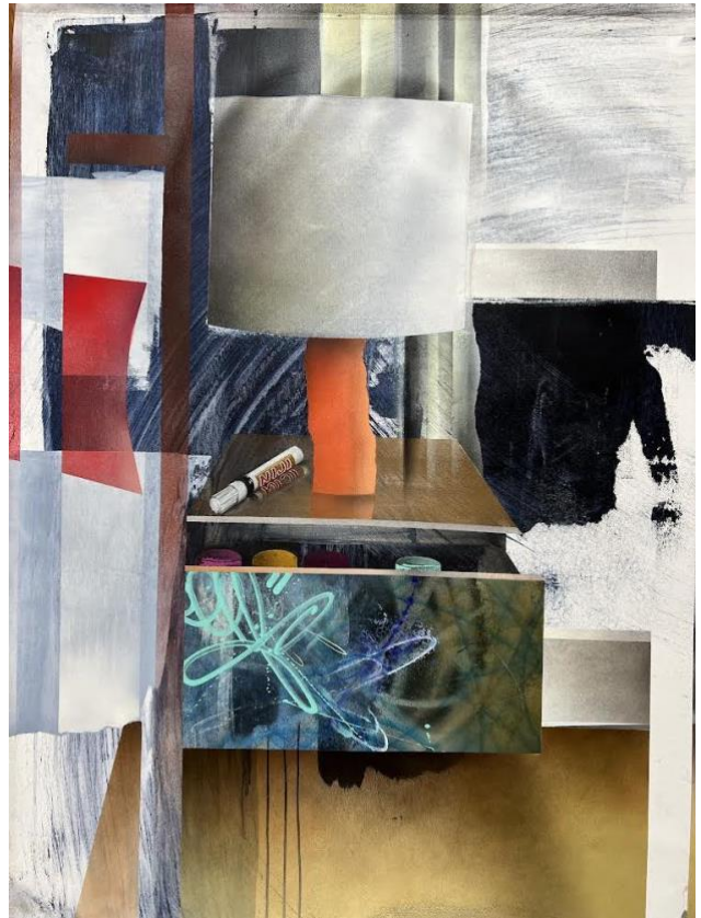
Lee Quiñones, Spit #3: Drawing Conclusions" 2024

Quiñones has also created a new series of drawings, works on paper that fuse his sharp wit and social consciousness with the aesthetics of the street. Executed in ink, pencil, and paint marker, these drawings embody the energy and experimental spirit of the graffiti writer's black book.