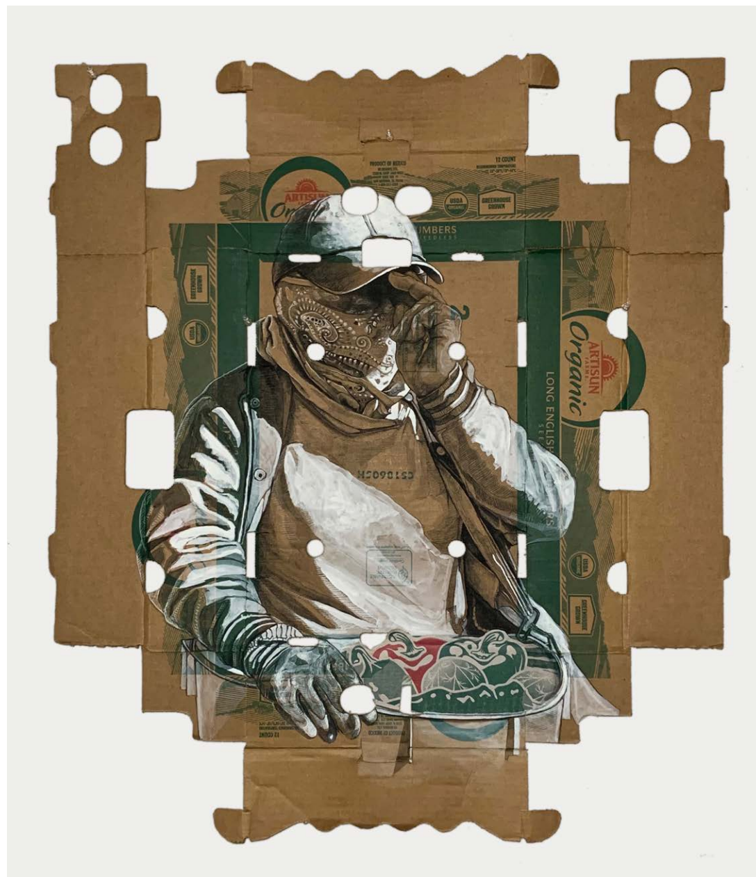
Green Organic Ink, gouache, charcoal, and collage on found produce box 34 x 30 inches 2020