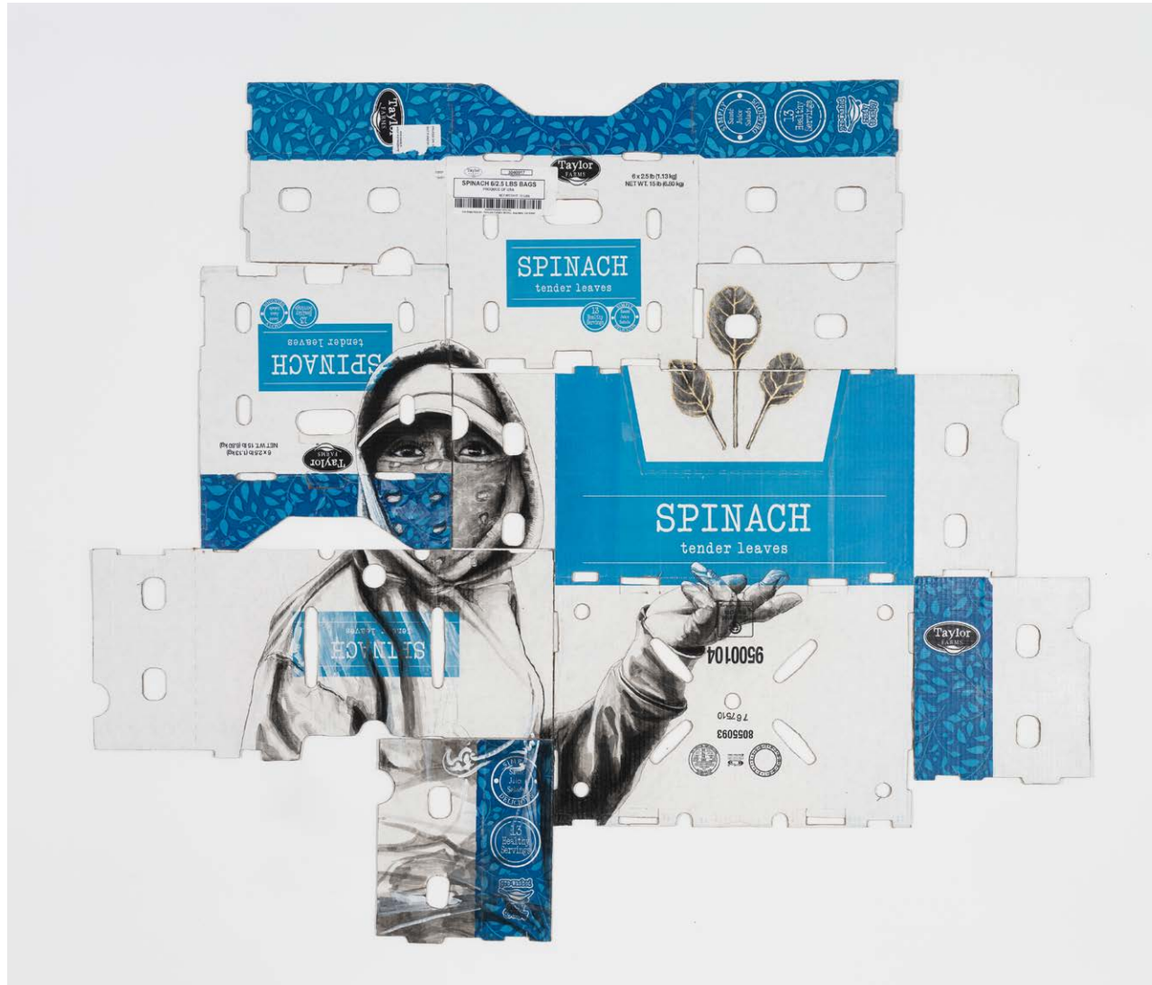
Tender Leaves Ink, charcoal, and gold leaf on produce cardboard box 52.50 x 62.50 Inches 2021