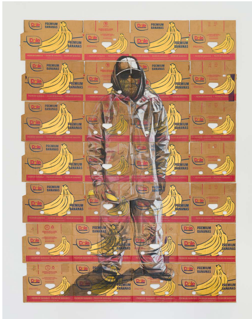
Banana Man Ink, Gouache, charcoal, and collage on produce cardboard boxes 93.5 x 72 inches 2021