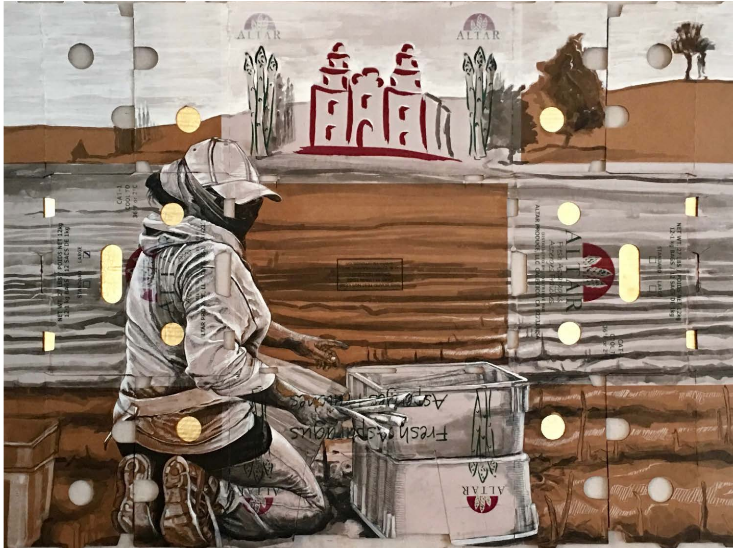
Sunday Morning II Ink, Gouache, and Charcoal on Produce box 33 x 44 Inches 2019

Collection of Crocker Art Museum, Sacramento, CA