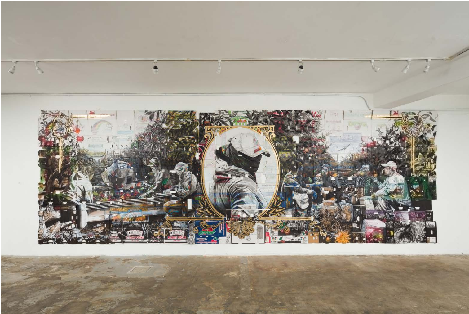
Always Fresh Ink, Charcoal, Gouache, Gold Leaf, Collage and Multiple Small Oil on Canvas Paintings on Reclaimed Produce Boxes 92.5 x 278 Inches 2018