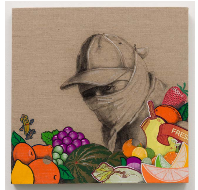
The Brave 1, 2, 3 Charcoal and Produce Label Collage on Linen 20 x 20 inches / each 2020