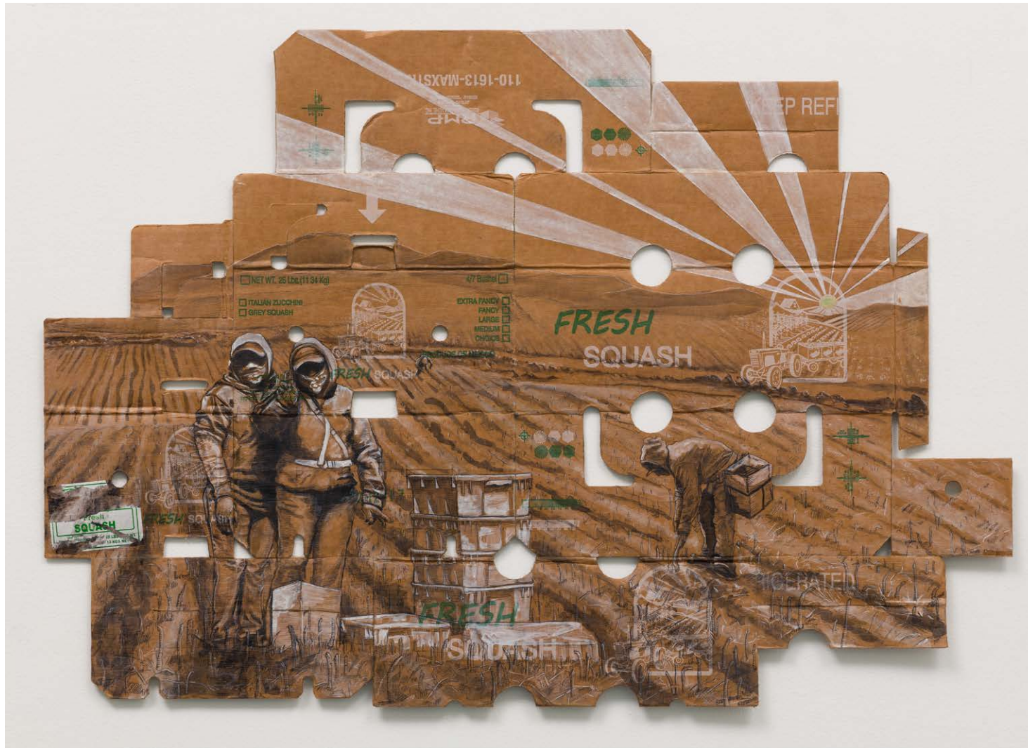
In The Fresh Ink, Gouache, Charcoal and Matte Gel on Found Produce Box 29.75 x 42.25 inches 2020