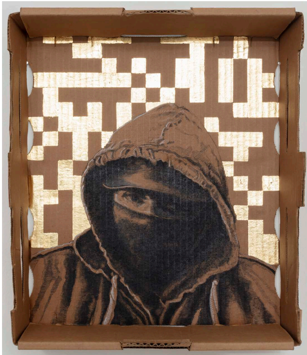
The Harvester Charcoal and Gold Leaf on Found Produce Box 16 x 13.5 x 5 inches 2020