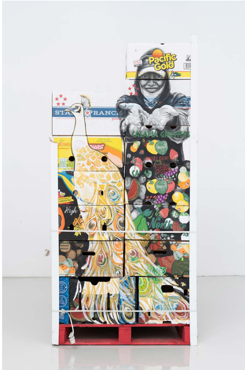
Pacific Gold Ink, Gouache, charcoal, collage, acrylics, and small paintings on produce boxes 82 x 40 x 48 inches 2021