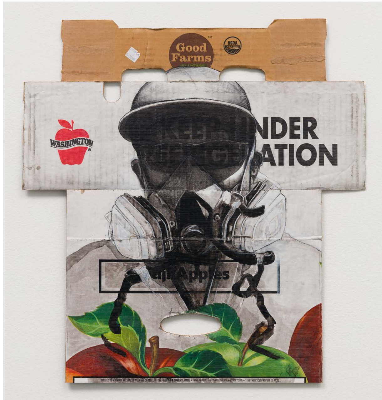
Good Farms Ink, Gouache, Charcoal and Matte Gel on Found Produce Box 20.75 x 19.75 inches 2020