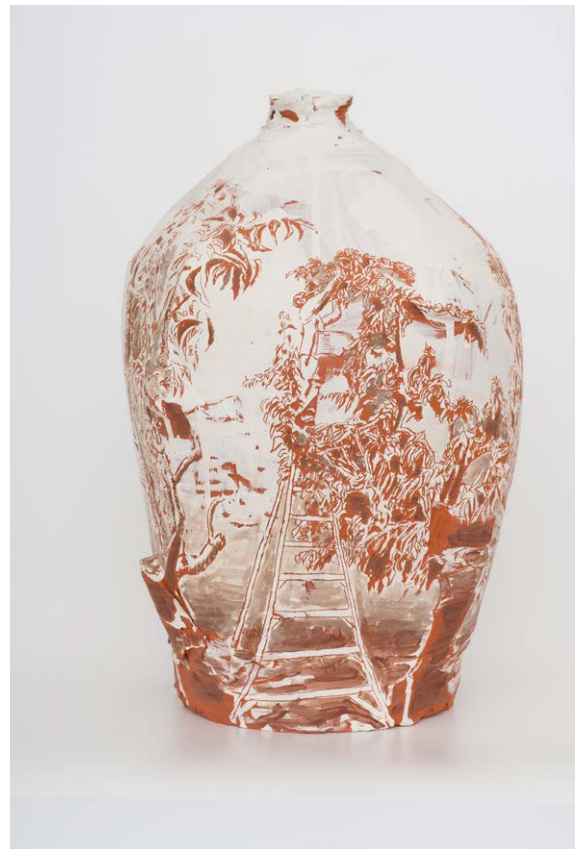
Untitled Two (Collaboration with Gerardo Monterrubio) Sgraffito and Underglazes on Ceramic Vase Approx. 20 x 12 x 15 Inches 2018