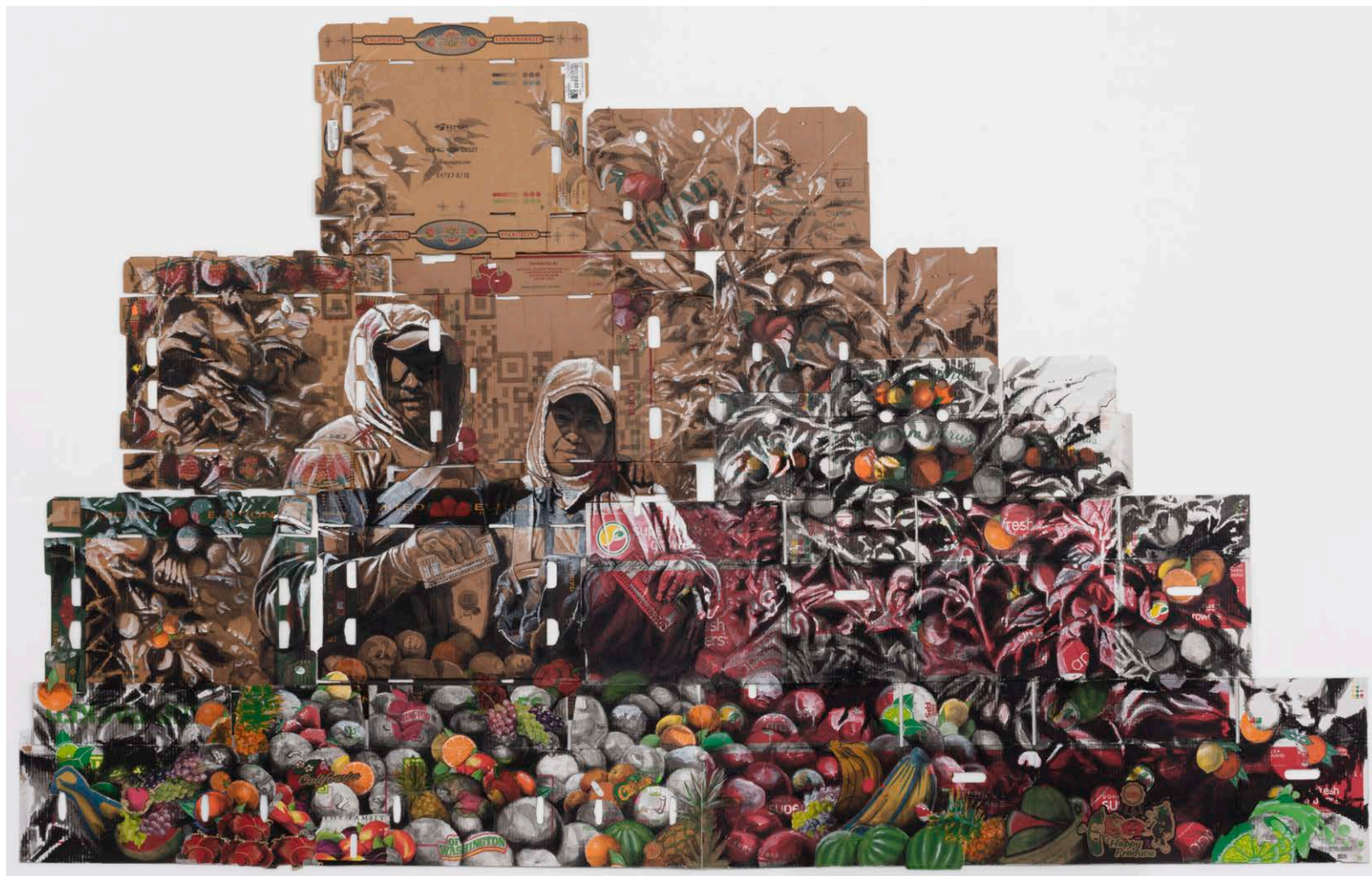
Super Fresh Ink, Gouache, Charcoal, and Collage on Found Produce Boxes 84 x 133 inches 2020