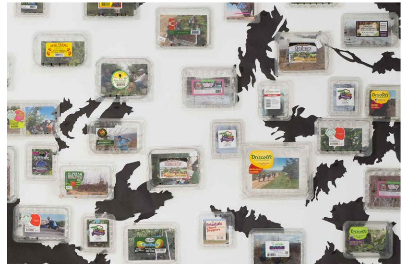
Tree of Life Installation Details