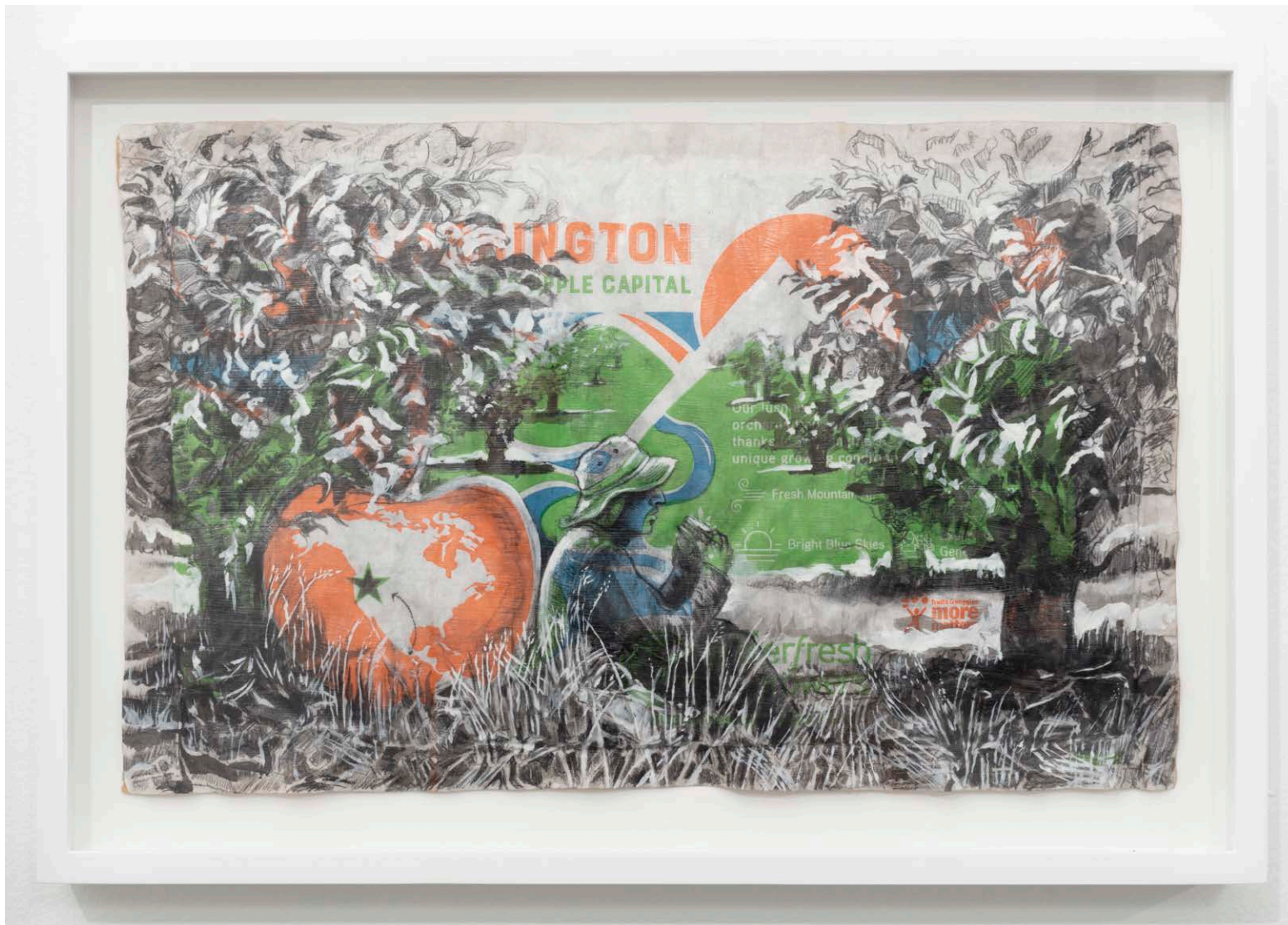
Eat Fresh Ink, Gouache, and Charcoal on Apple Protective Cushion 12 x 19 inches 2019