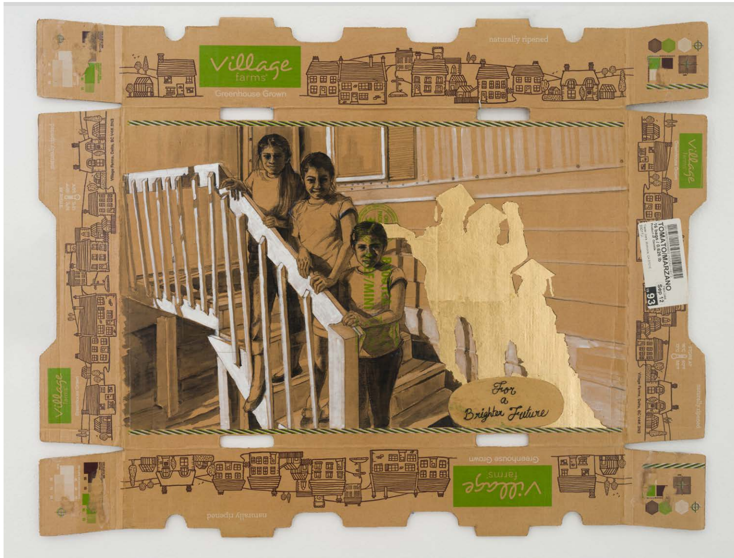
To a Brighter Future Ink, gouache, charcoal, and gold leaf on produce cardboard box 24 x 30.75 inches 2021