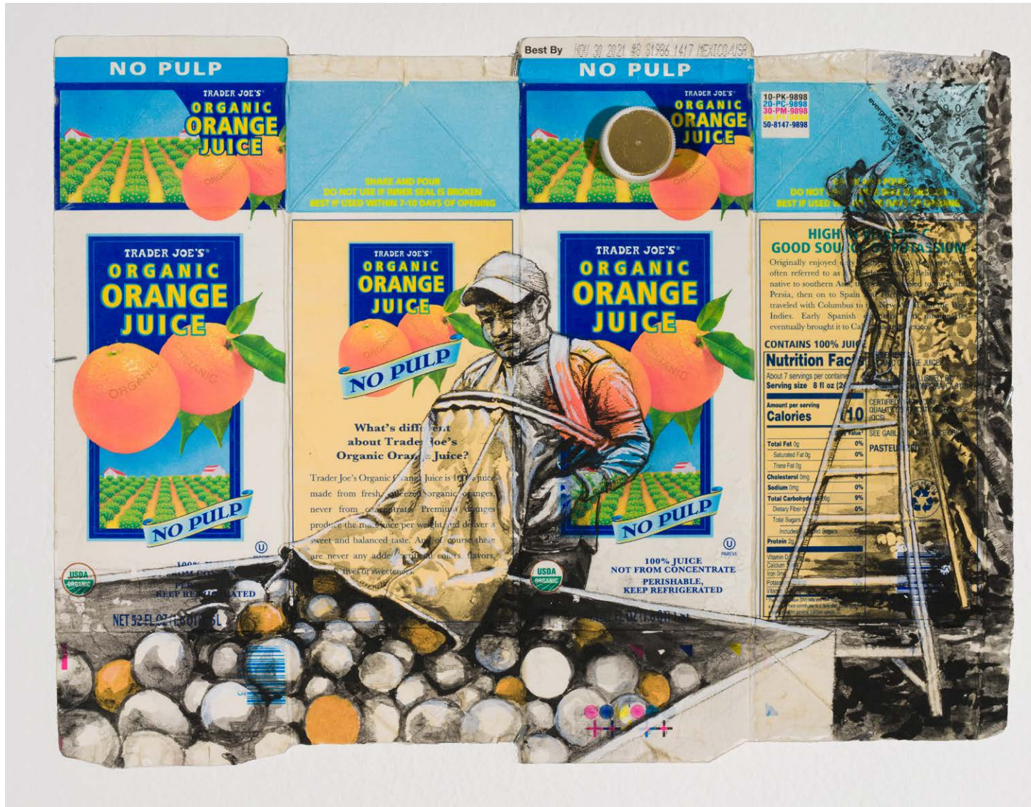
Golden Crop Ink, gouache, charcoal, and acrylics on juice carton 11.75 x 15.25 inches 2021