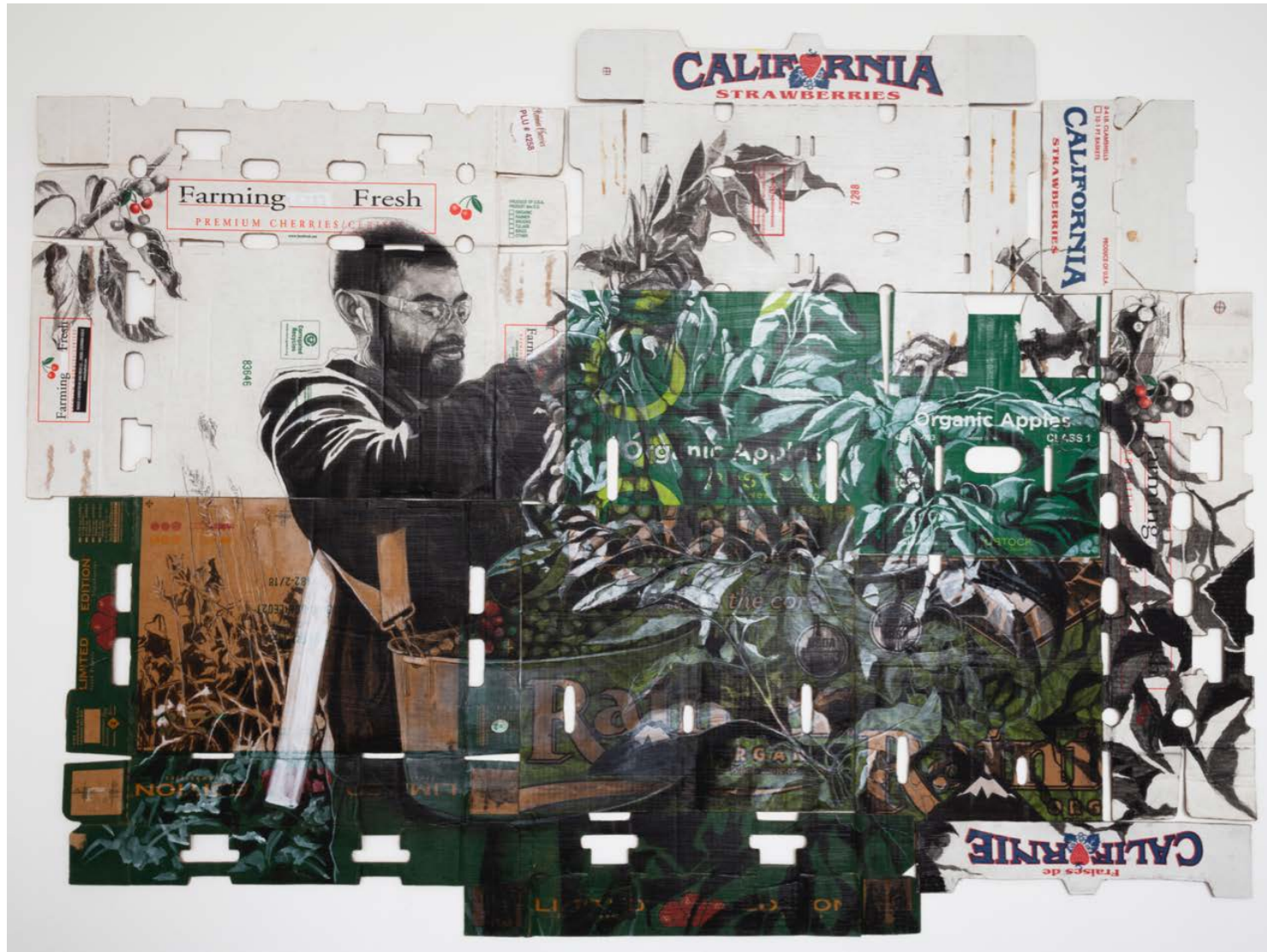
Self-Portrait En La Cherry (with Strawberry Fields Forever in the Background) Ink, Charcoal, Gouache and Matte Gel on Produce Cardboard boxes 53 x 72 inches 2020

Collection of Santa Barbara Museum of Art