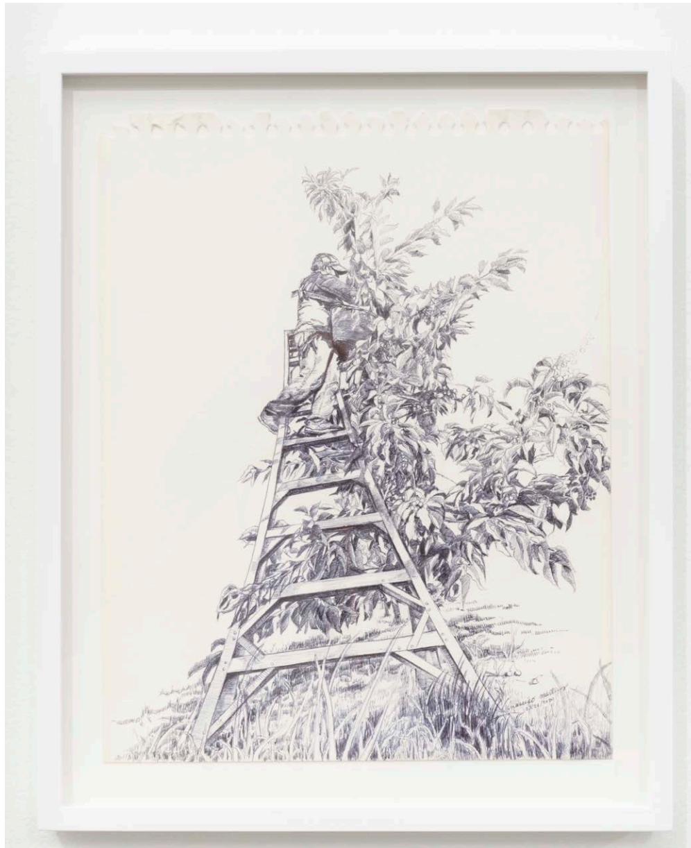
Picking Cerezas Ink Pen on Paper Sheet: 14 x 11 inches Framed 2020