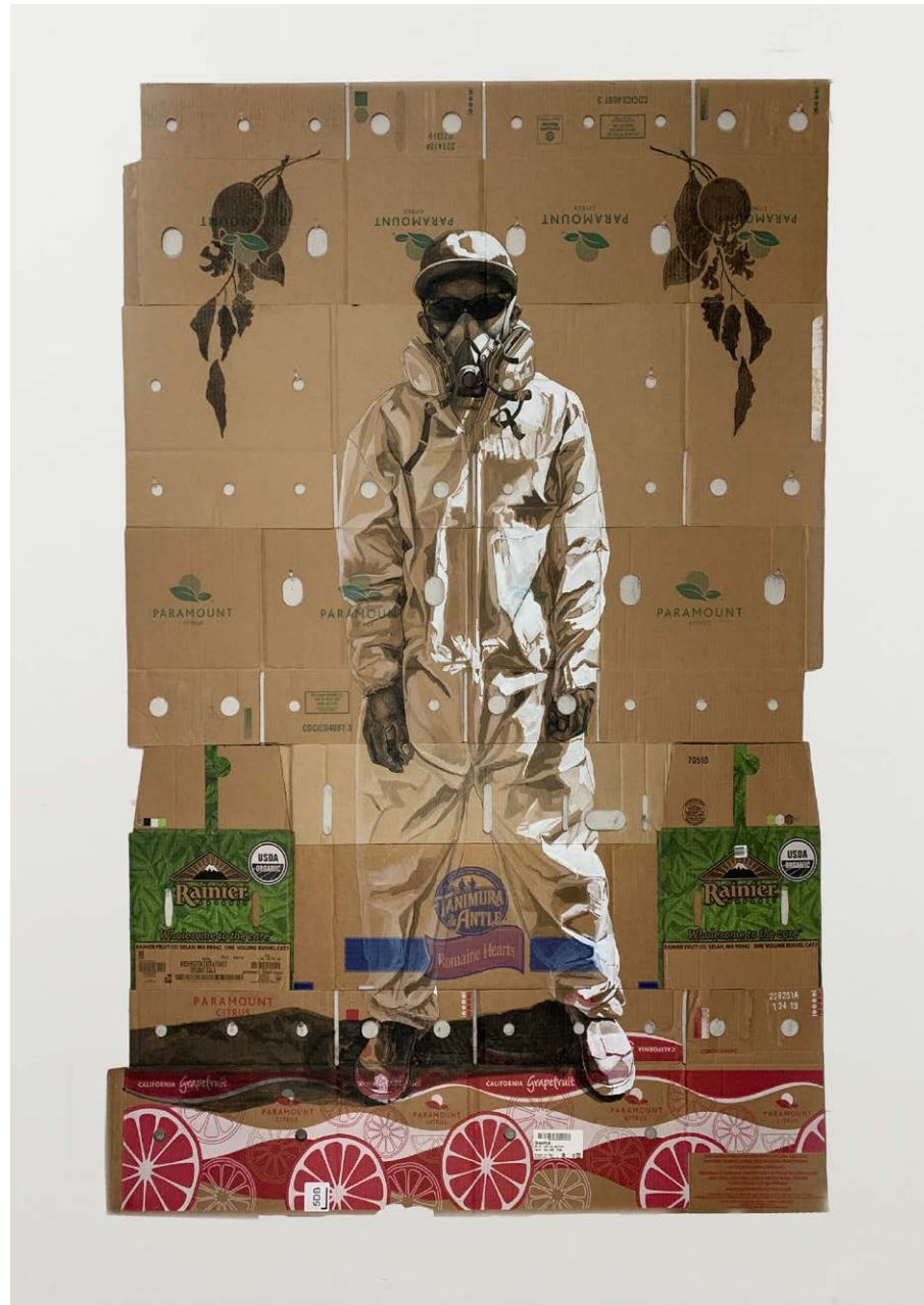
The Weed Sprayer Ink, Gouache, and Charcoal on found produce box 82 x 56 inches 2020