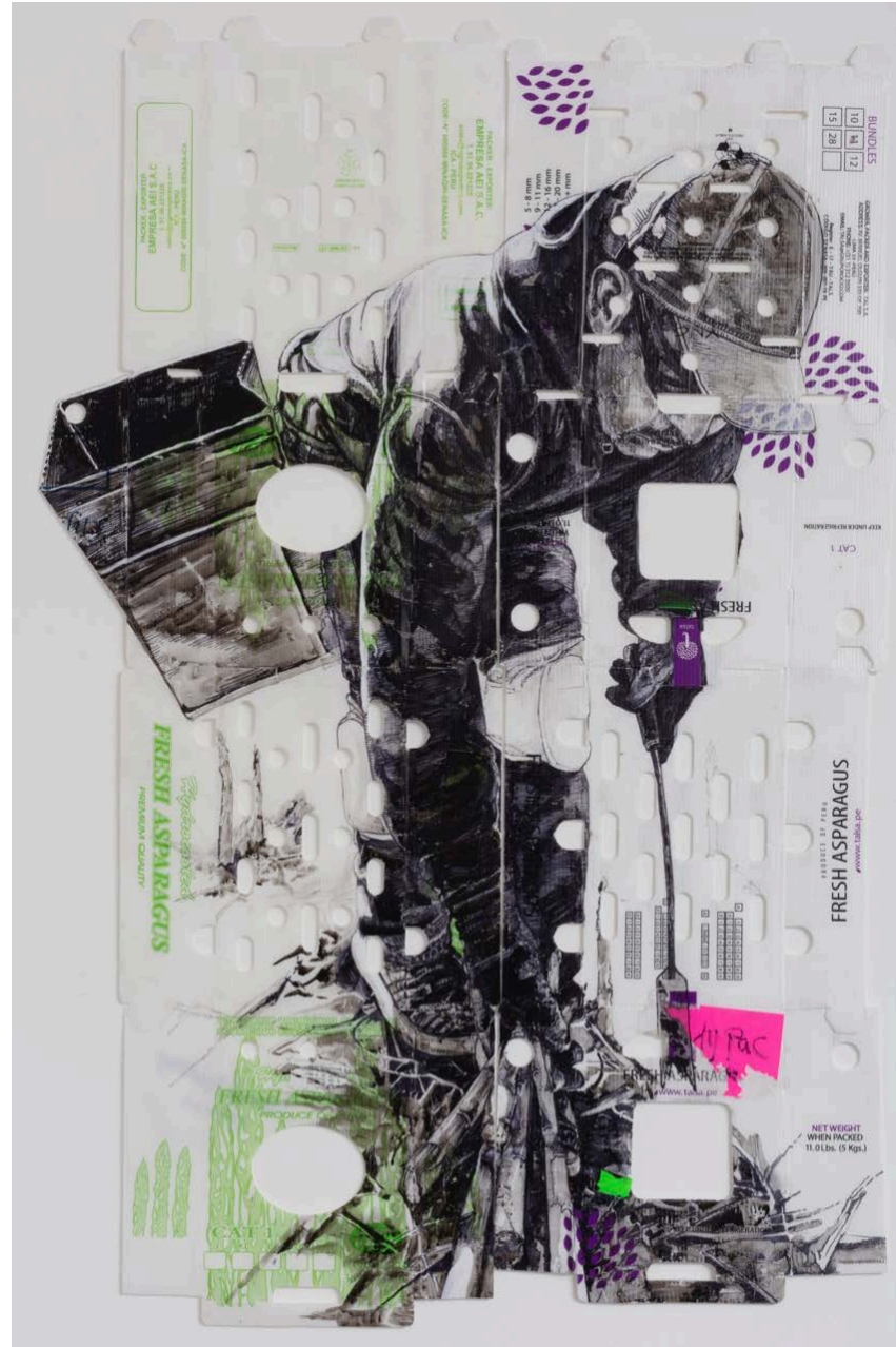
Fresh Cut (The Beginning of a New Day) Ink, Gouache, and Sharpie on Plastic Asparagus box 45.5 x 29.5 inches 2020