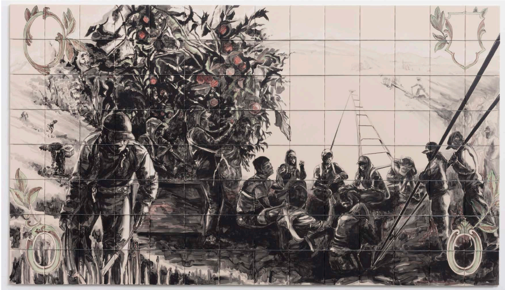
Philosophy in the Fields Ceramic tiles with glazes 48 x 84 inches 2020

Collection of The Lucas Museum of Narrative Art, Los Angeles