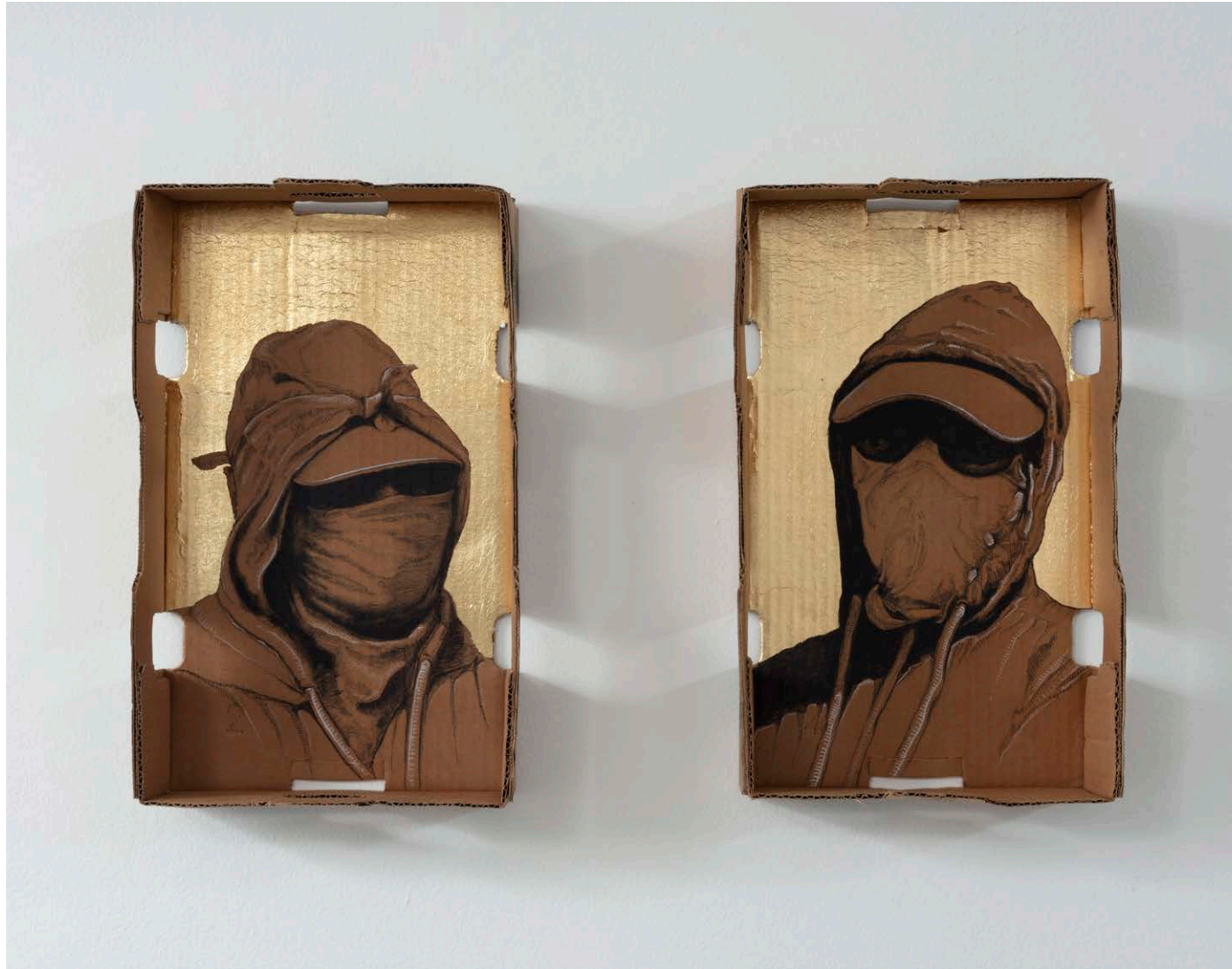
Golden Pickers Diptych Charcoal and Gold Leaf on Found Produce Boxes 15.5 x 10 x 3 inches/each 2020