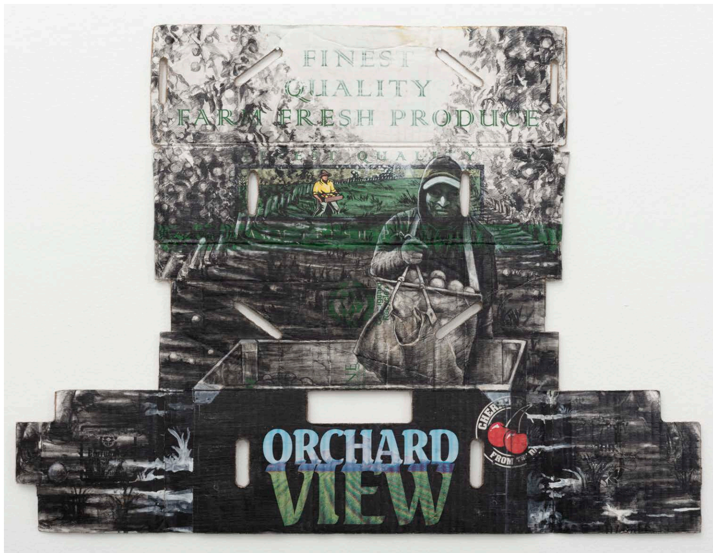
Orchard View Ink, Gouache, and Charcoal on Found Produce Box 21.75 x 29 inches 2020