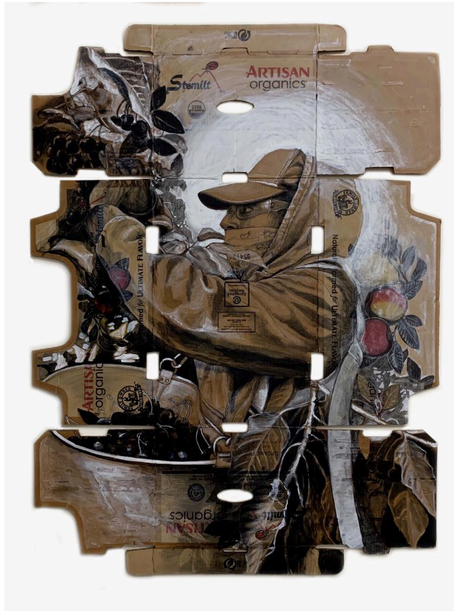
Artisan Organics Ink, Gouache, Charcoal, and Matte Gel on Produce Cardboard Box 51 x 38 Inches 2020