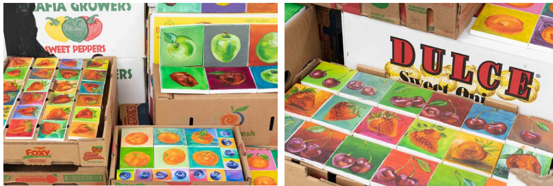
Pacific Gold Ink, Gouache, charcoal, collage, acrylics, and small paintings on produce boxes 82 x 40 x 48 inches 2021