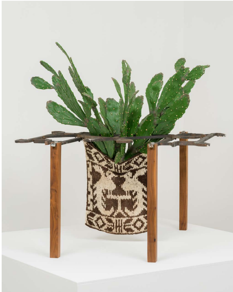
The Seed Must Grow Regardless 1920's iron window grill from an LA home, walnut legs, Guatemalan morrál, 8 artificial cacti, hardware 36 x 36 x 42 inches 2022