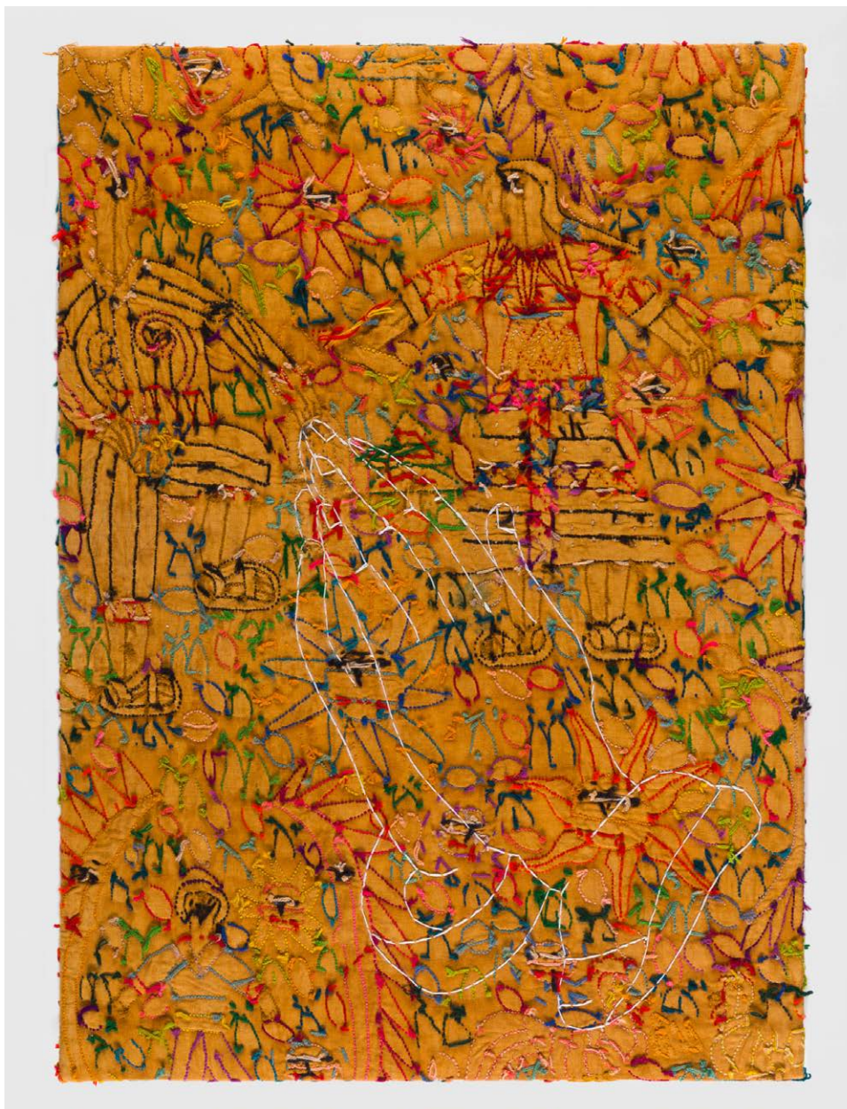
A Prayer for MacArthur Park White tread on back side of Guatemalan huipil over wood panel 30 x 21.5 inches 2022