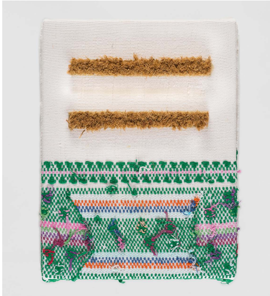
A Gracious Welcome Back of Guatemalan huipil and strips from a welcome mat over panel 12 x 9 inches 2022