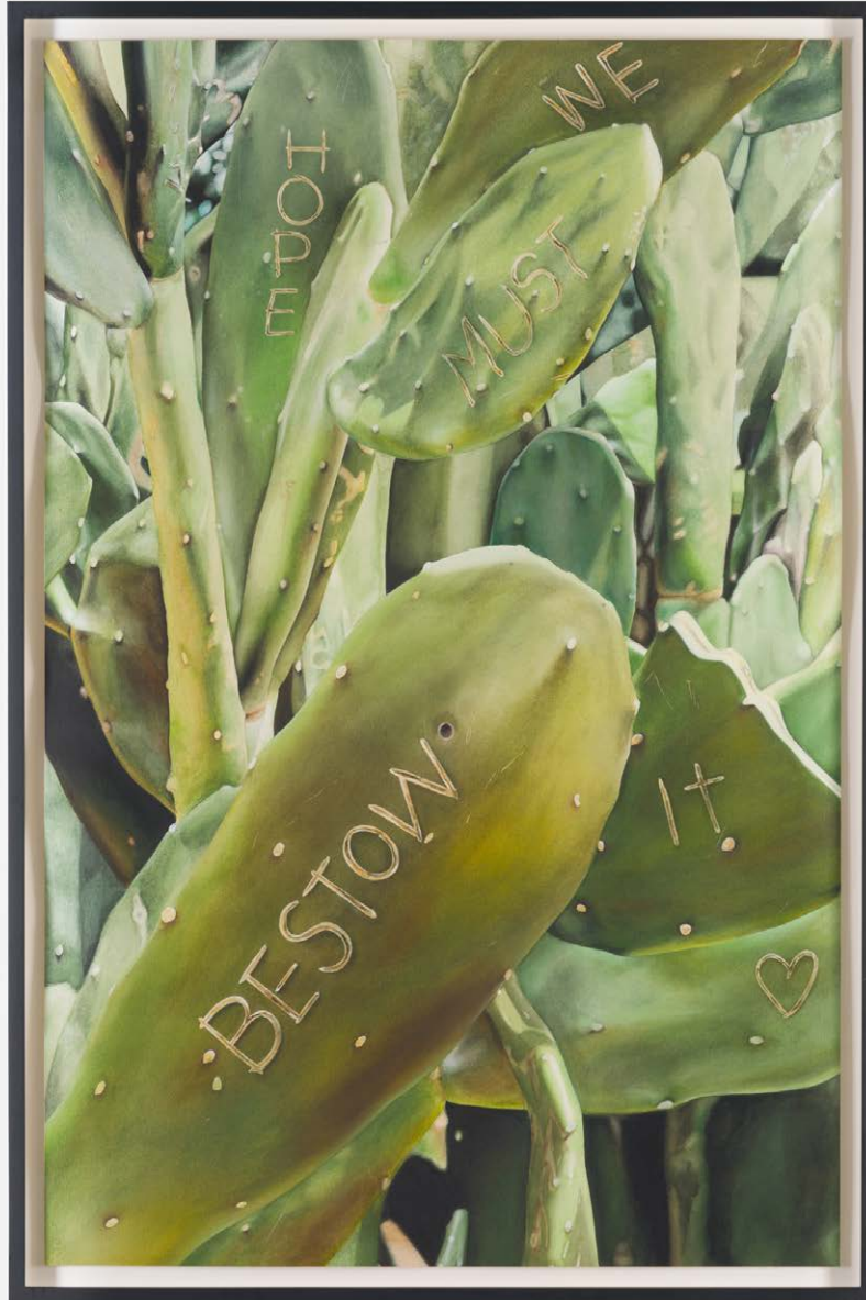
Hope We Must Bestow It Watercolor on paper 37 x 24 inches 2021