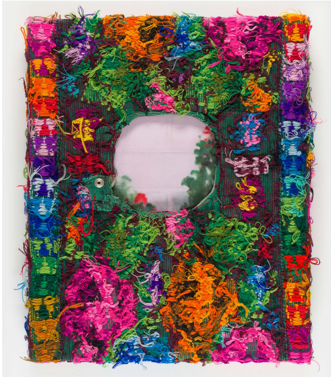
Curtain Of Day Watercolor and back of Guatemalan huipil over panel 18.5 x 15 inches 2022