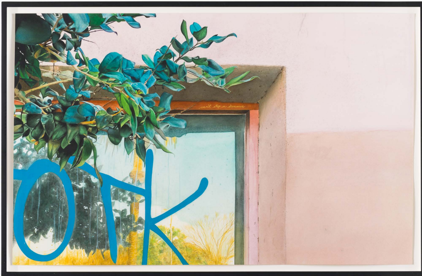
Can't Stop a Dreamer Watercolor on paper 23.25 x 37 inches 2021