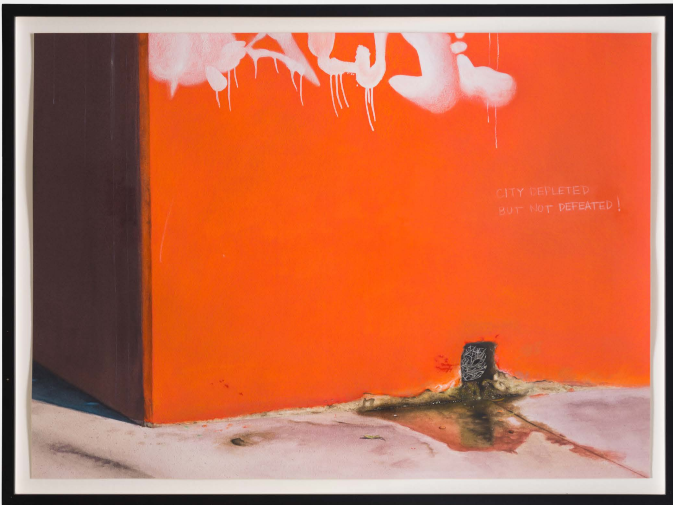
City Depleted But Not Defeated Watercolor on paper 18.5 x 25.5 inches 2021