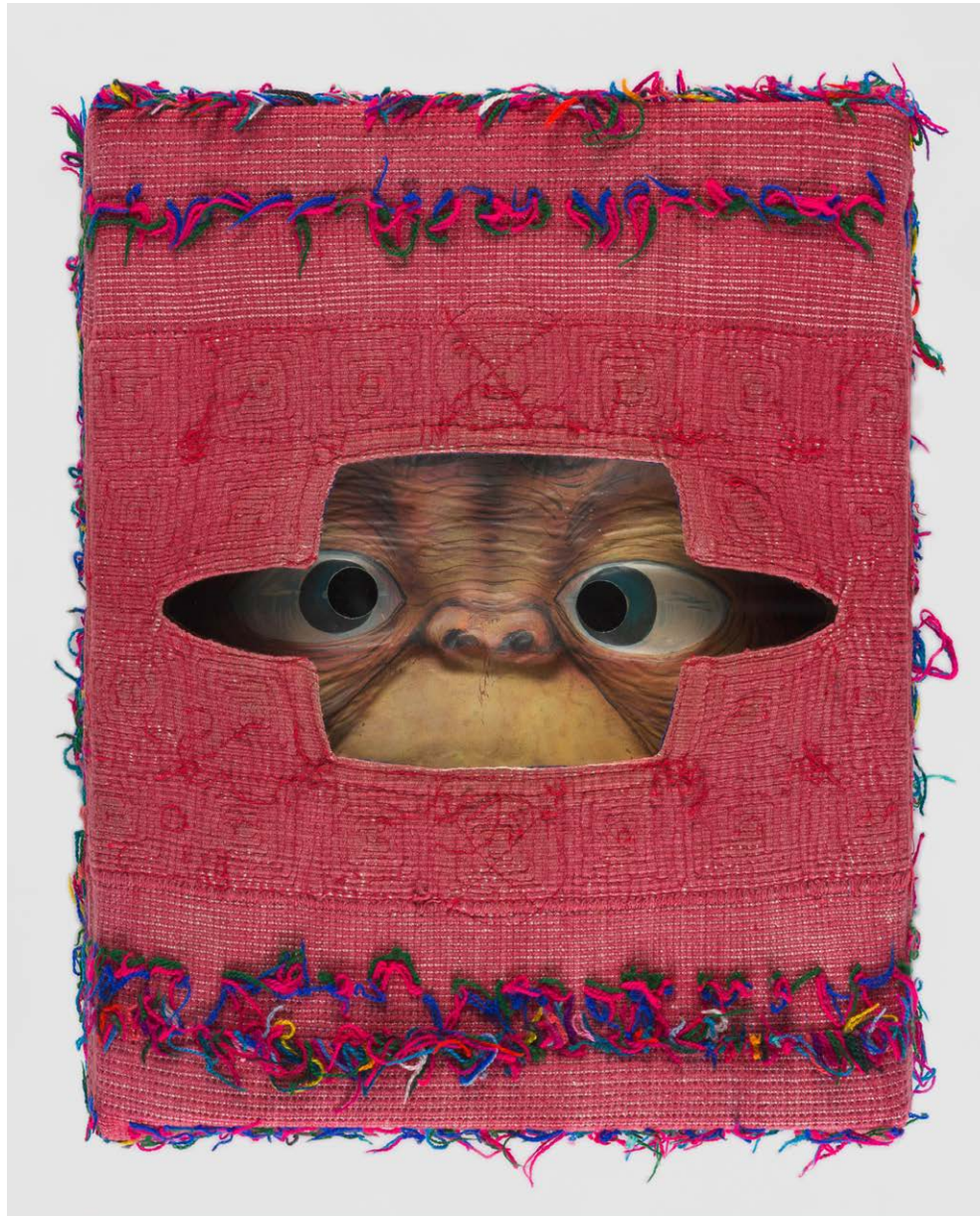
Double Conciencia Back of Guatemalan huipil over framed 1980's E.T. mask 12.75 x 10.25 inches 2021