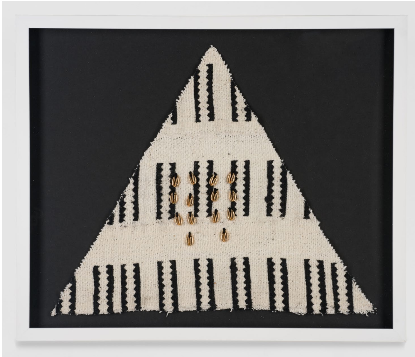
Patrisse Cullors Okanran Meji Sourced vintage mud cloth from Mali 1955, cowrie shells, yarn Framed: 20 x 24 inches 2023