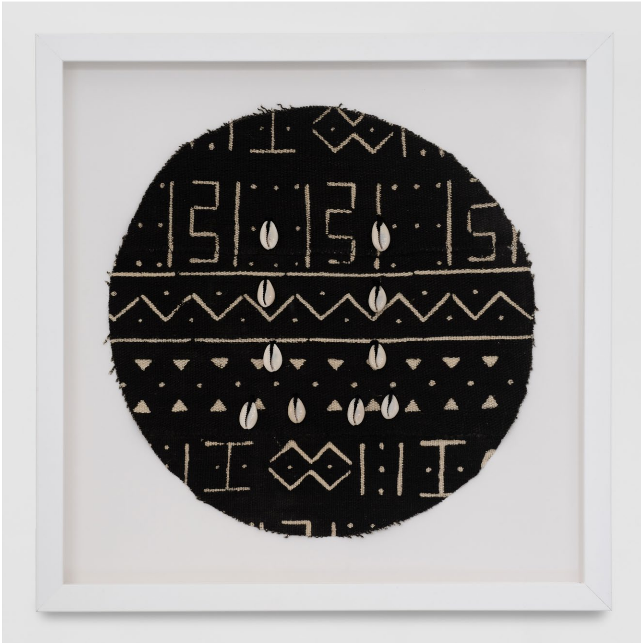
Patrisse Cullors Ogunda Meji Sourced vintage mud cloth from Mali 1955, cowrie shells, yarn Framed: 17 x 17 inches 2023