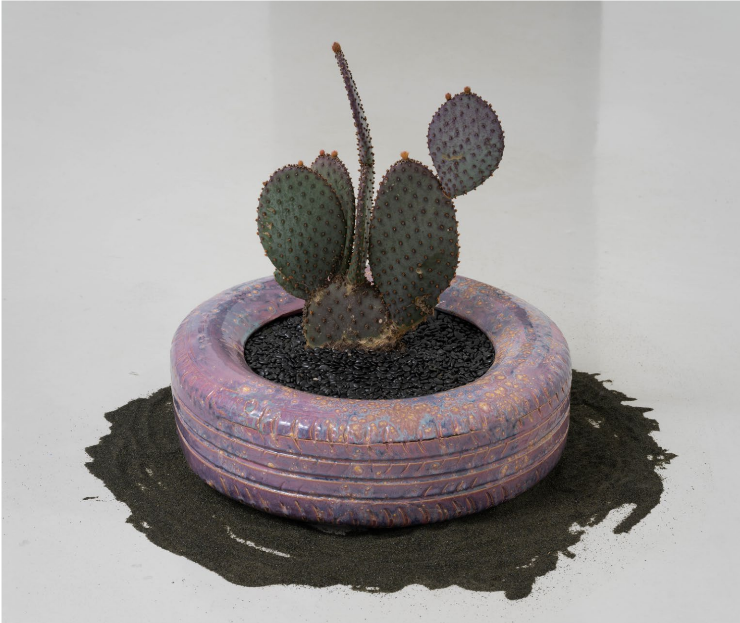
noé olivas Prayers of Longevity Clay, cactus, black sand, compost soil Dimensions Variable 2023