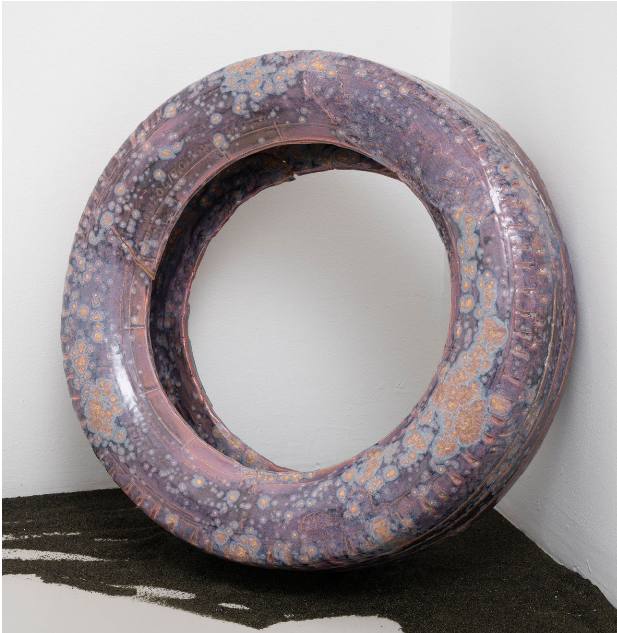
noé olivas Prayers of Coolness Clay, water, black sand Dimensions Variable 2023