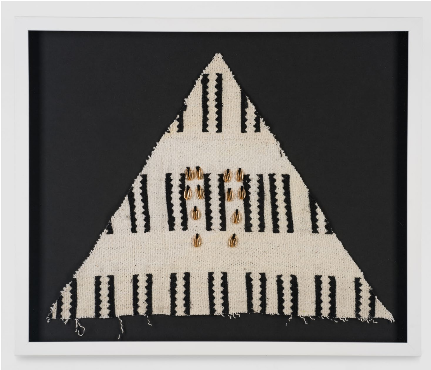
Patrisse Cullors Owonrin Meji Sourced vintage mud cloth from Mali 1955, cowrie shells, yarn Framed: 20 x 24 inches 2023