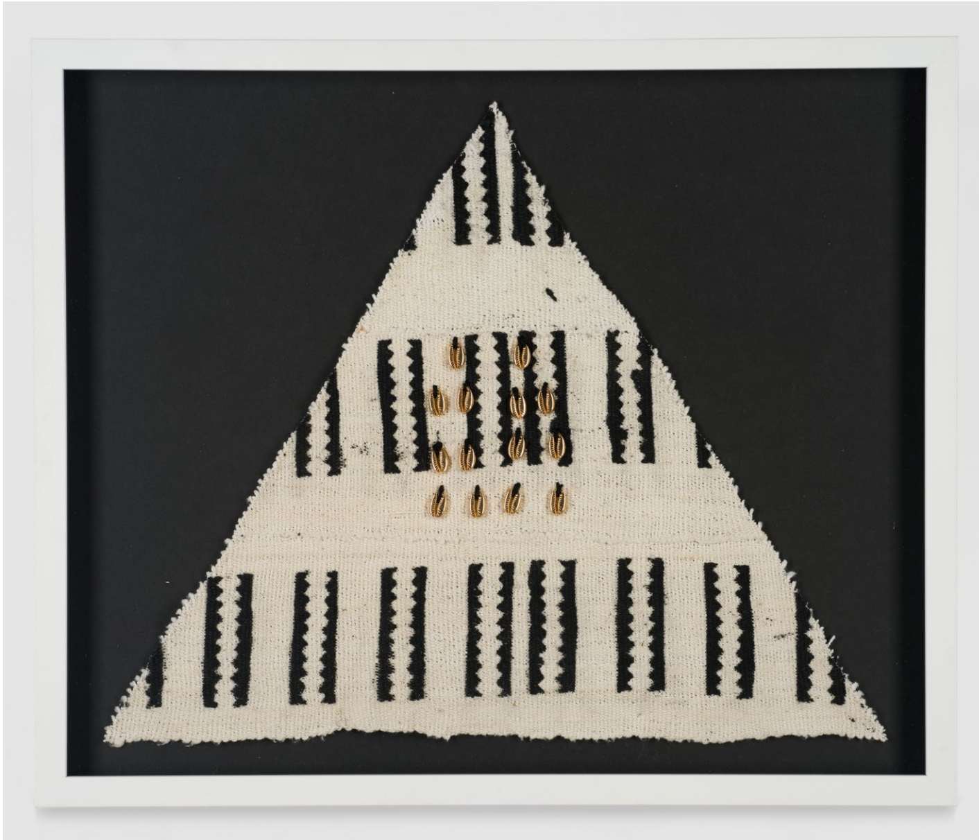
Patrisse Cullors Obara Meji Sourced vintage mud cloth from Mali 1955, cowrie shells, yarn Framed: 20 x 24 inches 2023