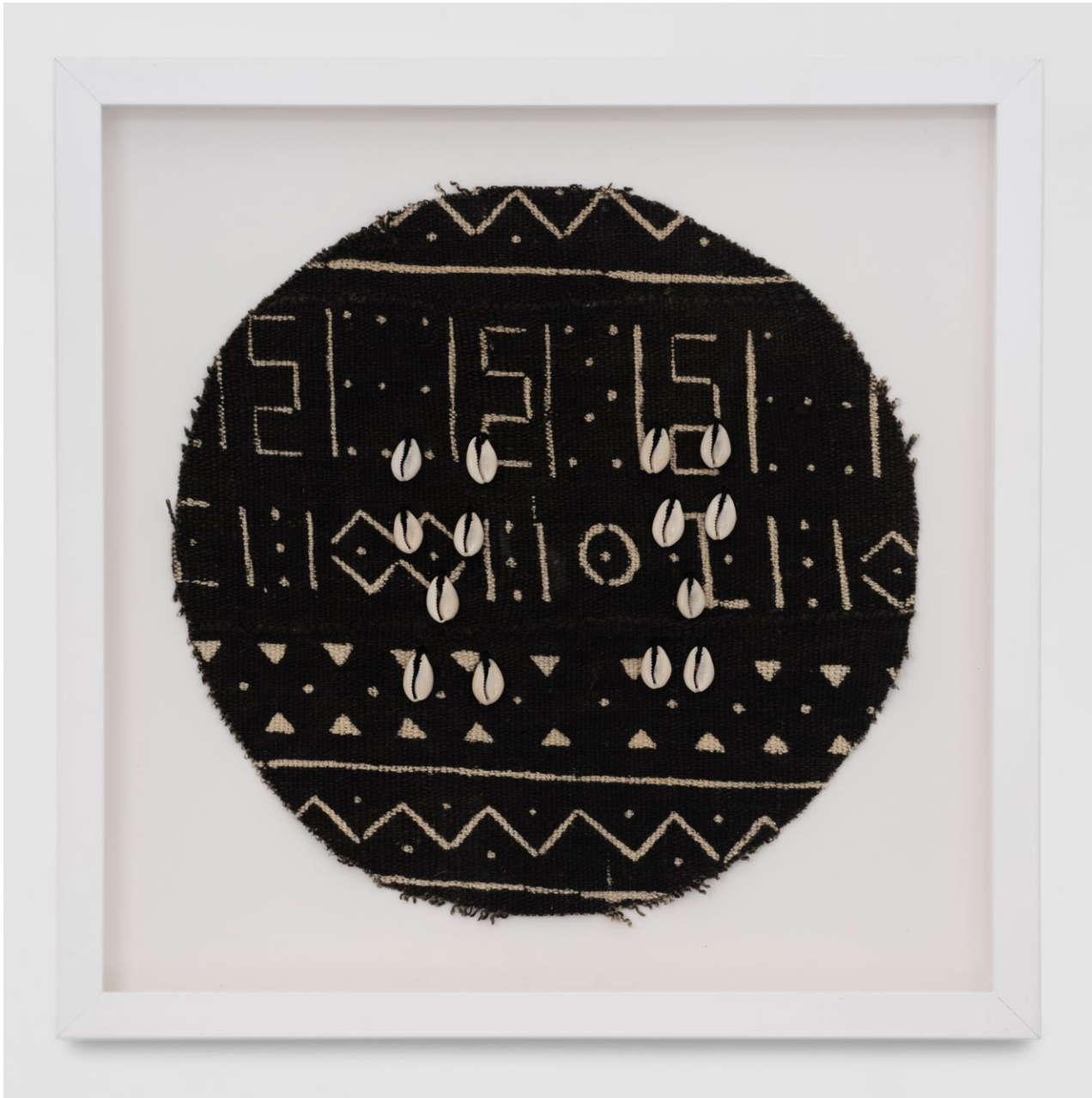
Patrisse Cullors Oturupon Meji Sourced vintage mud cloth from Mali 1955, cowrie shells, yarn Framed: 17 x 17 inches 2023