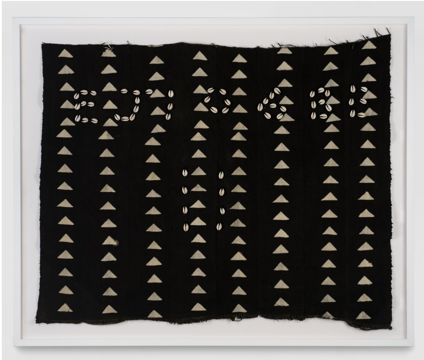
Patrisse Cullors Eji Ogbe Sourced vintage mud cloth from Mali 1955, cowrie shells, yarn Framed: 37 x 45 inches 2023