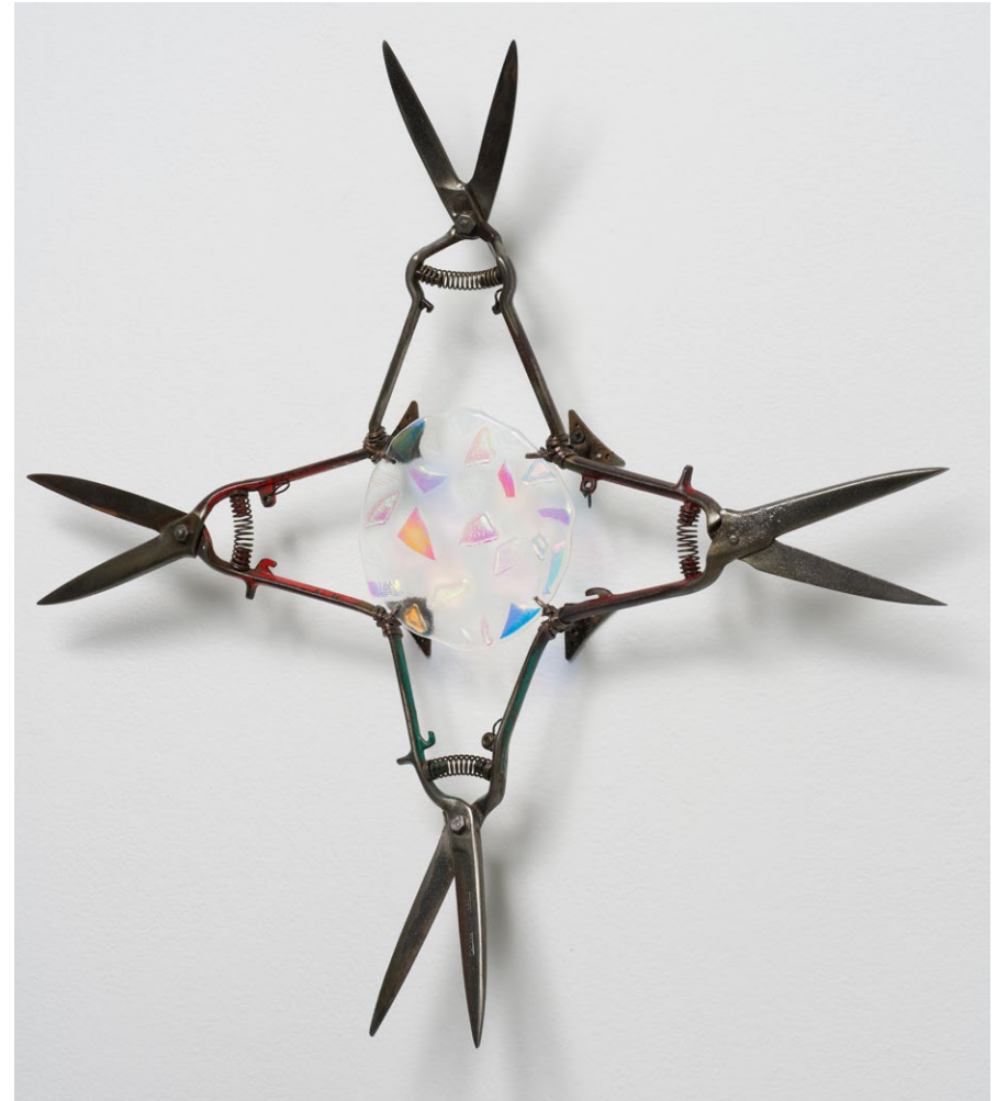
noé olivas Prayers of Guidance Garden shears, cooper, dichroic glass, metal 26 1/4 x 27 1/4 in x 3 1/2 inches 2023