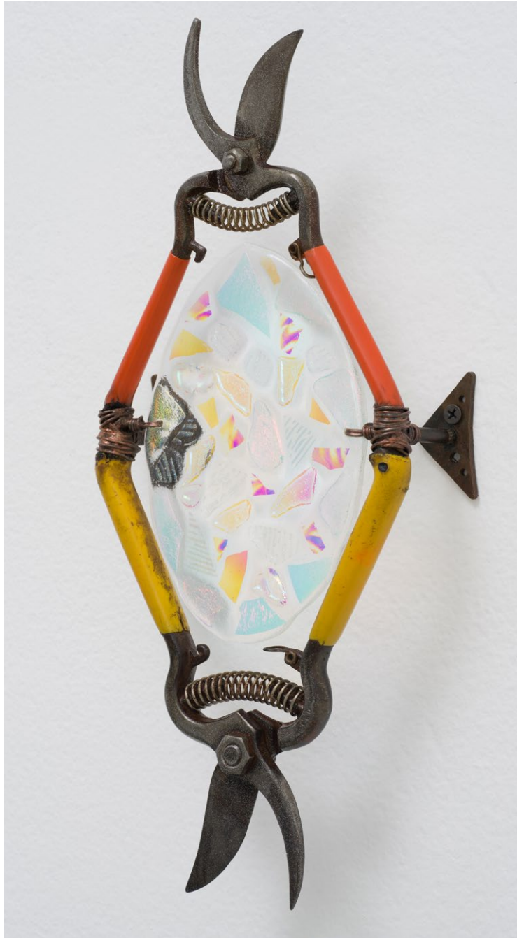
noé olivas Prayers of Support Garden shears, cooper, dichroic glass, metal 14 5/8 x 6 1/2 x 2 3/8 inches 2023