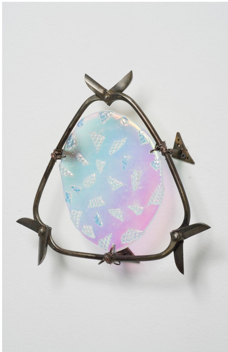
noé olivas Prayers of Protection Garden shears, cooper, dichroic glass, metal 12 x 13 x 2 1/4 inches 2023